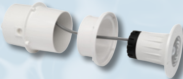
housing, dress ring & light

The Aqua-Star Pool Lighting System combines many unique features resulting in a spectacular, ultra-reliable lighting system that is user friendly and easy to install.