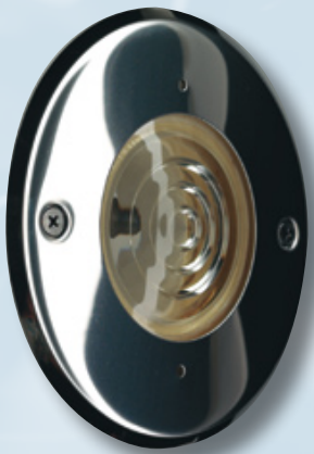
optional stainless steel trim ring